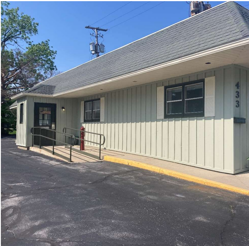
Pictured above is the updated exterior of the Transformation Life Center.